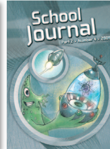
School Journal Part 2 Number 4 2009