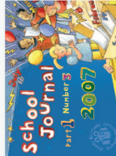
School Journal Part 1 Number 3 2007

These materials use three texts from the Ministry of Education's instructional series to support the curriculum learning and the writing tasks. The selected texts have themes that relate to the context of traditions and taonga.