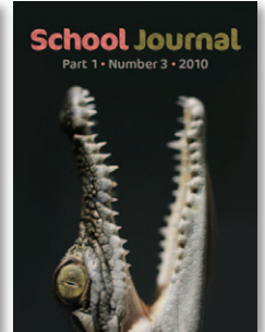
School Journal Part 1 Number 3 2010