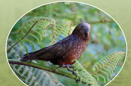
Kākā live in forests.