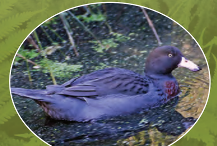
Whio (blue ducks) live in rivers.