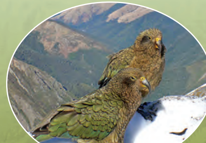
Kea live in the mountains.

Another danger is from changes to the birds' habitats (the places where the birds live). For example, many birds live in forests, but people often cut down the trees to make space for houses. People also use a lot of plastic, and that can get into the ocean and kill seabirds.