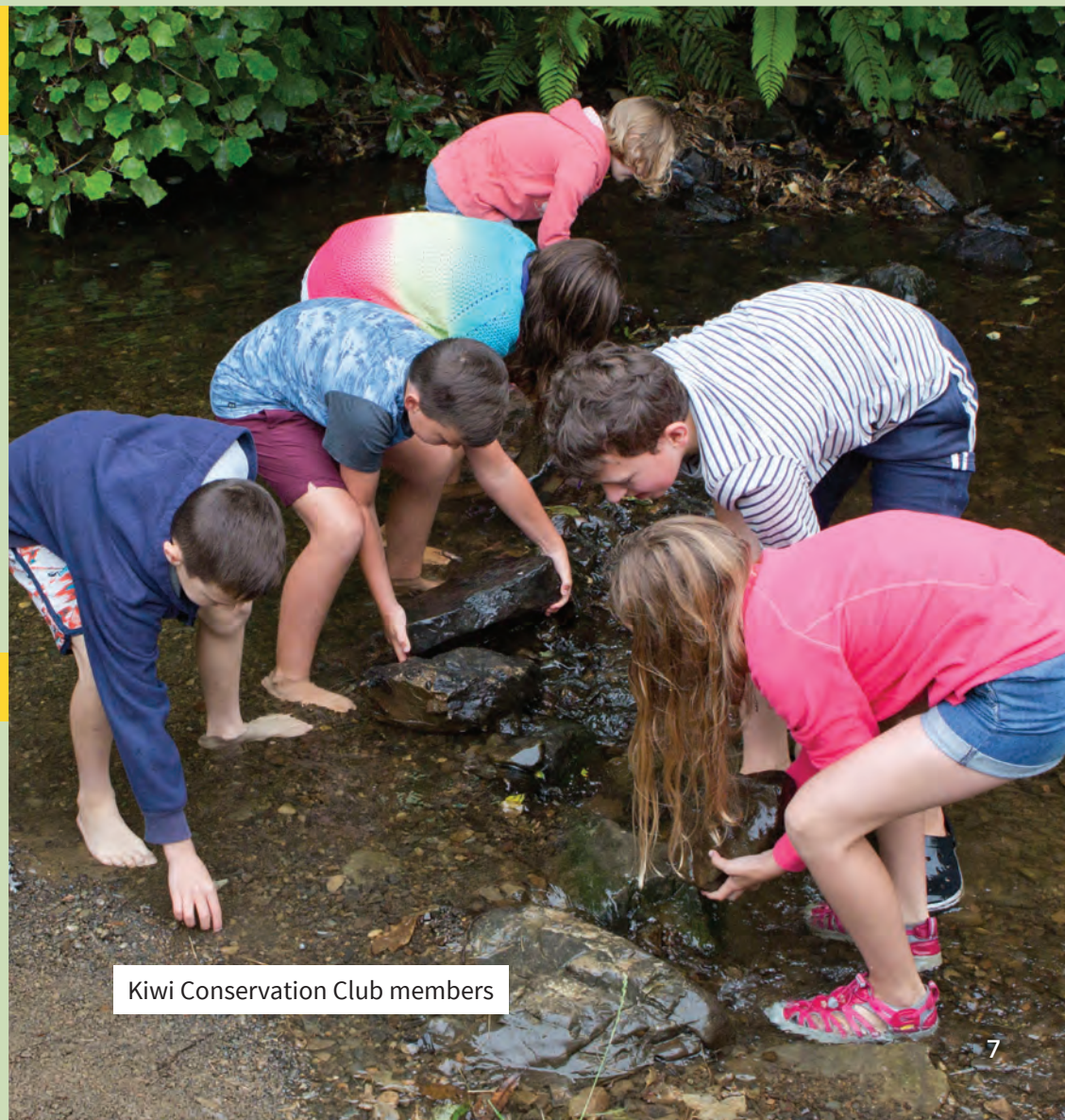
Kiwi Conservation Club members

Anyone can vote. The only rule is that you can vote only once. You can vote online, by email, or by posting a letter.