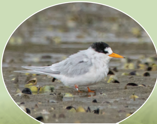
A fairy tern – tara iti

The Bird of the Year competition helps people to understand what makes our native birds special and why we need to look after them.