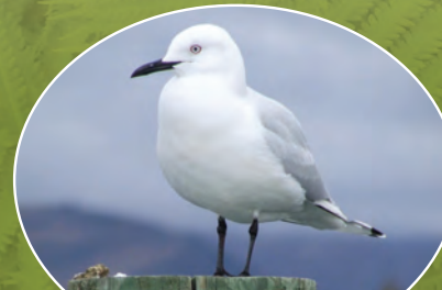
Tarāpuka (black-billed gulls) live on the seashore.