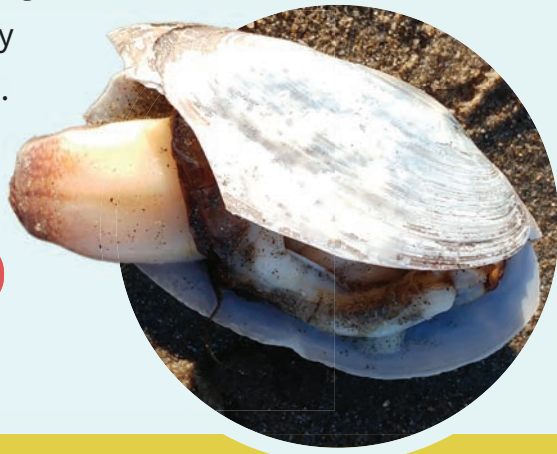
A mollusc in its shell

A mollusc has a soft body and no bones, but many molluscs have a hard shell. The shell helps to keep the mollusc safe from predators such as seagulls, crabs, fish, and other, bigger, molluscs. It also stops the mollusc from drying out in the sun at low tide and protects its soft body from being damaged when it’s tossed around by ocean currents and waves.