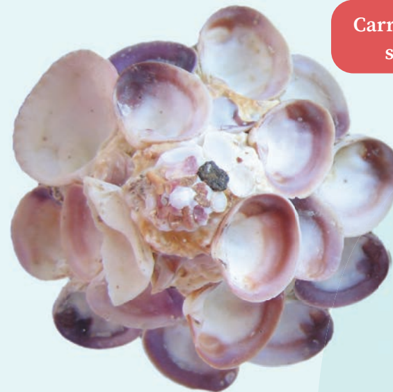
Carrier snail shells