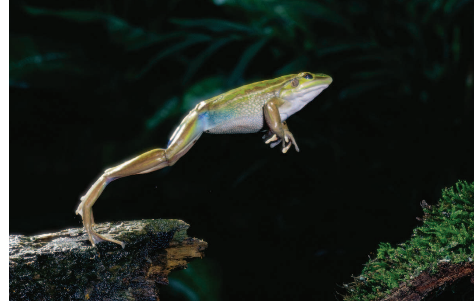
"Watch me!" croaked Frog,