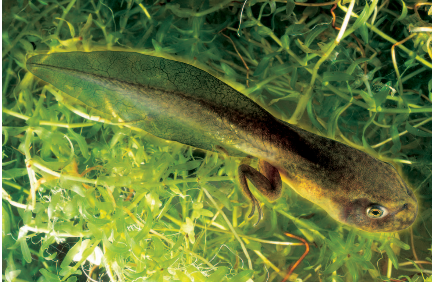
"Watch me!" said Tadpole,