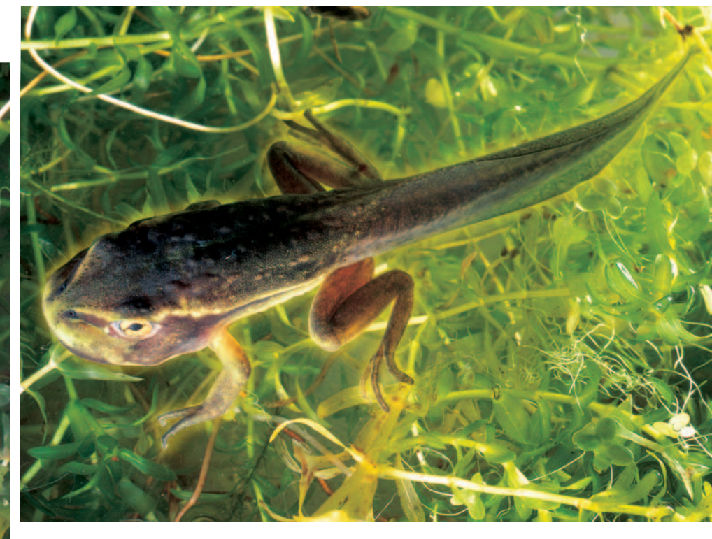
and that way ...