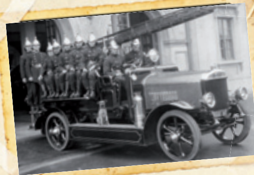
The Whanganui Fire Brigade outside the central fire station in 1926. Their mascot is sitting on the running board.