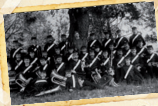
The Masterton District Brass Band with Roy, their mascot, pictured in 1903. They are wearing the medals they won in a competition.