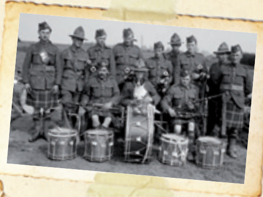
The Auckland Regimental Band with their mascot in France in 1918. Like mascots, bands were important in keeping up morale.