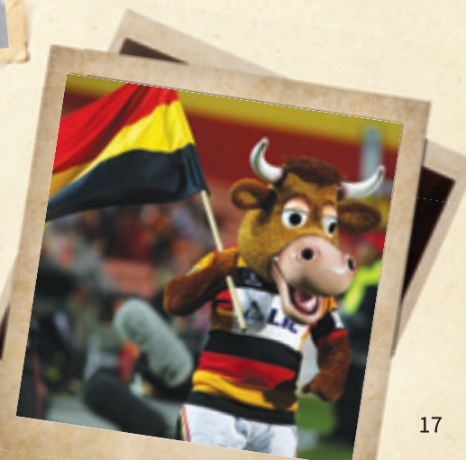
The Waikato district is well known for its dairy farming, so Mooloo is an appropriate mascot for the rugby team.