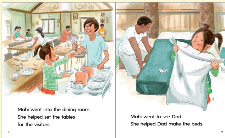
Mahi went into the dining room. She helped set the tables for the visitors.

A range of punctuation, including full stops, commas, speech marks, a question mark, and an exclamation mark, to support phrasing and meaning