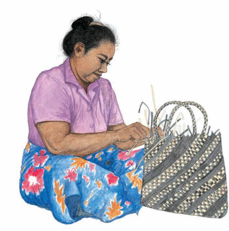
Sā fai e lo'u tinā la'u 'ato.