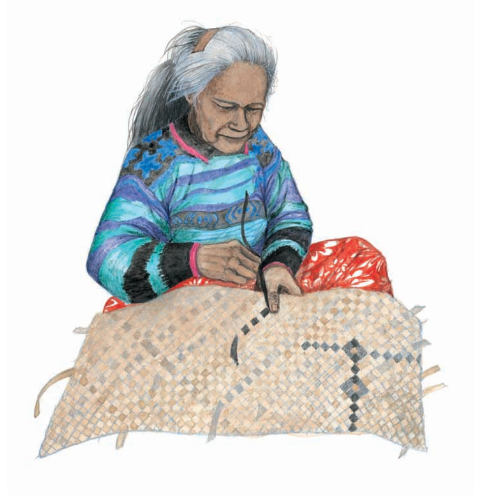
My grandmother made my mat.