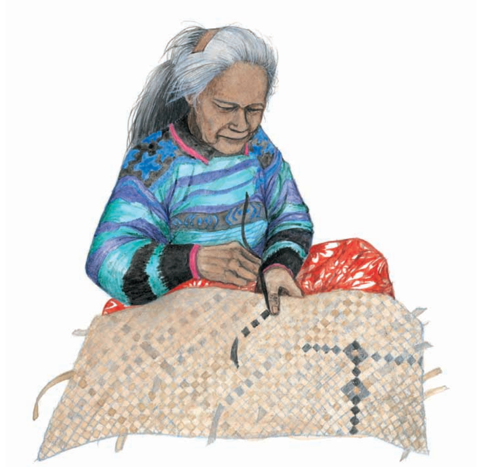
Sā fai e le tinā o lo'u tamā la'u fala.