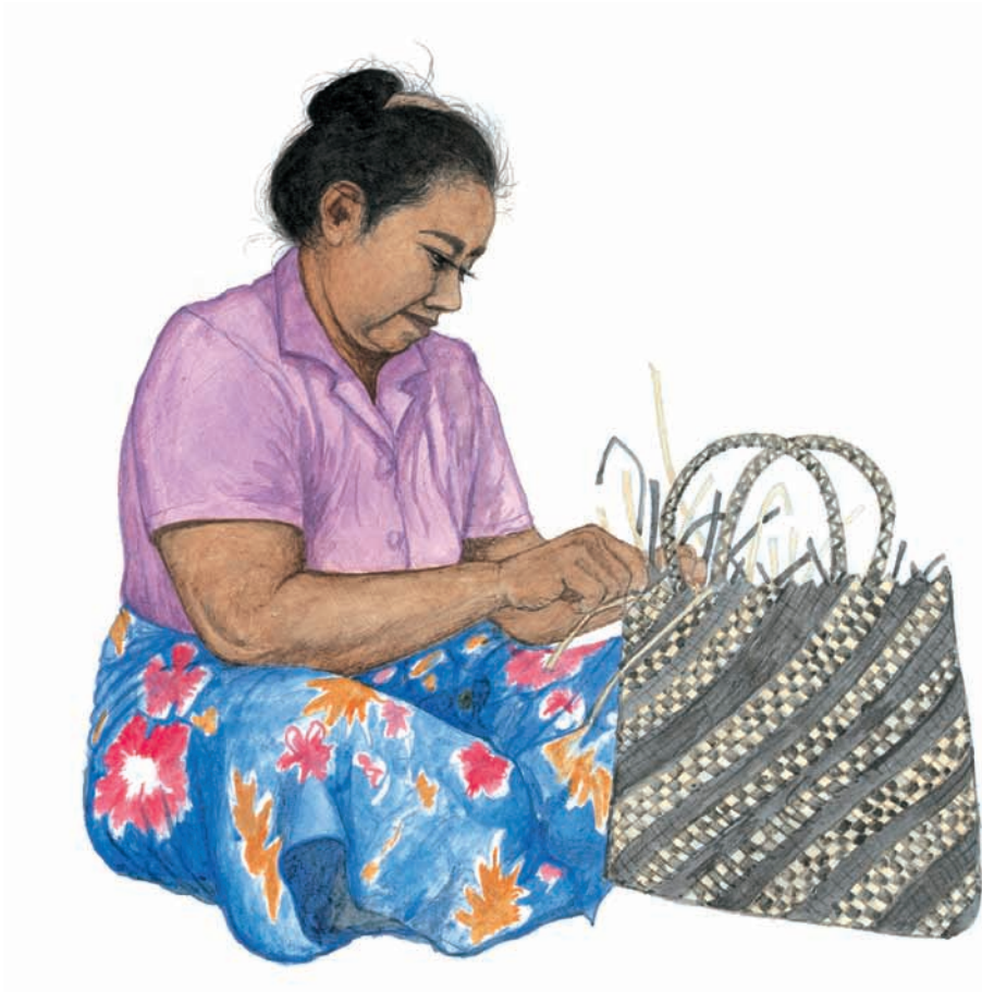
My mother made my basket.