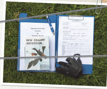
↑ The instructions tell the observers how to do their jobs.

Giving the observers clear instructions helps to make sure that they all record their data in the same way. That means the data is more likely to be reliable.