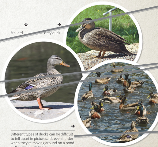
→ Different types of ducks can be difficult to tell apart in pictures. It's even harder when they're moving around on a pond or flying through the air.

It's easy to tell the difference between ducks and other birds. But it's not always so easy to tell one type of duck from another type of duck, so Nathan groups together all the data on ducks. This means Nathan doesn't have reliable information on each type of duck. But he does have reliable information on all ducks.