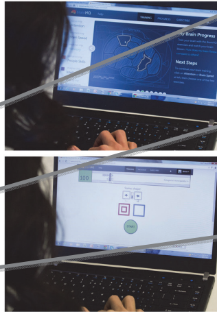
Using online brain-training exercises to stimulate the brain