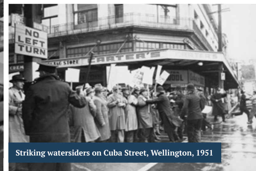
Striking watersiders on Cuba Street, Wellington, 1951

Imagine: you are involved in a dispute with your boss, and the government introduces laws to punish you. One of these laws makes it illegal for people to give you food, even though you have no money. This happened in 1951, when the men who worked on the wharves loading and unloading cargo asked for better wages. The watersiders were offered only a very small pay increase. They protested, refusing to do any overtime. The employers locked out the watersiders, saying they couldn't come to work until they agreed to do what they were told. Thousands of workers went on strike to support the watersiders.