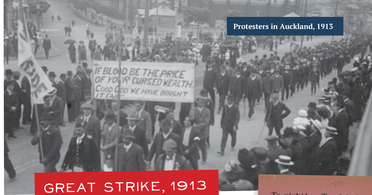
Protesters in Auckland, 1913