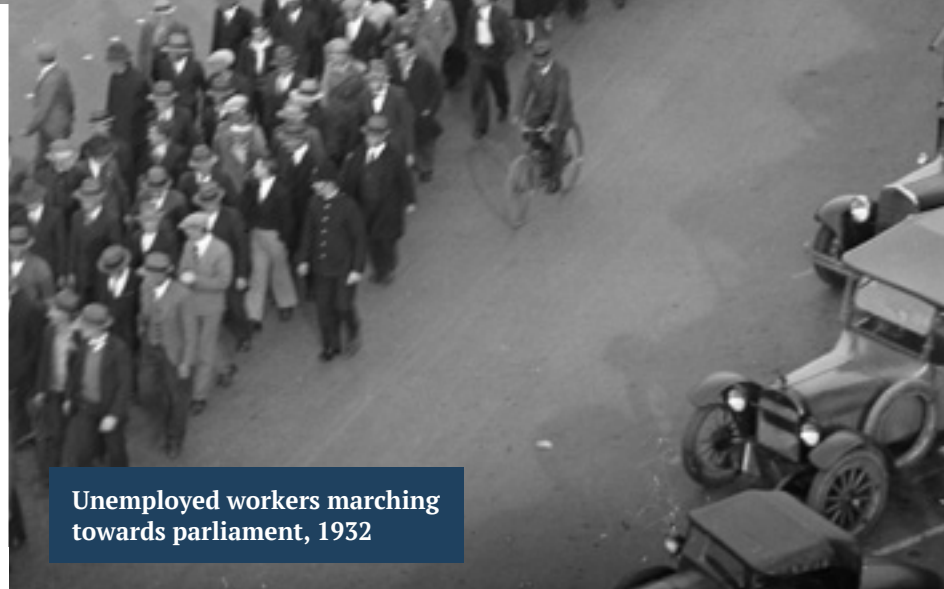
Unemployed workers marching towards parliament, 1932