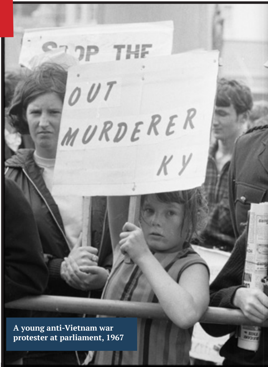
A young anti-Vietnam war protester at parliament, 1967

"One, two, three, four, we don't want your bloody war!" chanted a new kind of protester in the 1960s. These protesters were anti-war and opposed to New Zealand soldiers fighting in Vietnam. They believed the Vietnam war was a civil war and New Zealanders shouldn't be supporting one side or the other. Hundreds of protests took place around the country between 1965 and 1970. These involved thousands of people. Many of the protesters were university students who used new protest tactics, such as sit-ins, occupations, graffiti, music, and street theatre. At one protest in Auckland, people smeared their bodies with red paint to symbolise the deaths of Vietnamese civilians.