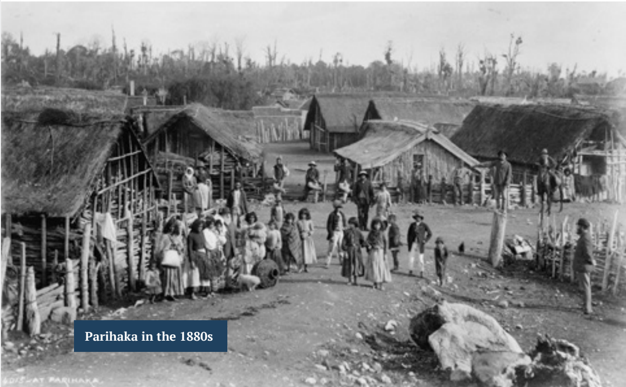
Parihaka in the 1880s

What else have New Zealanders protested about over the last 150 years? And what forms did their protests take?