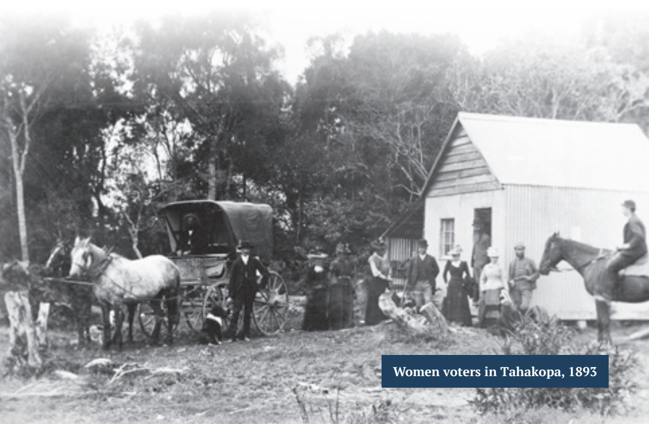
Women voters in Tahakopa, 1893