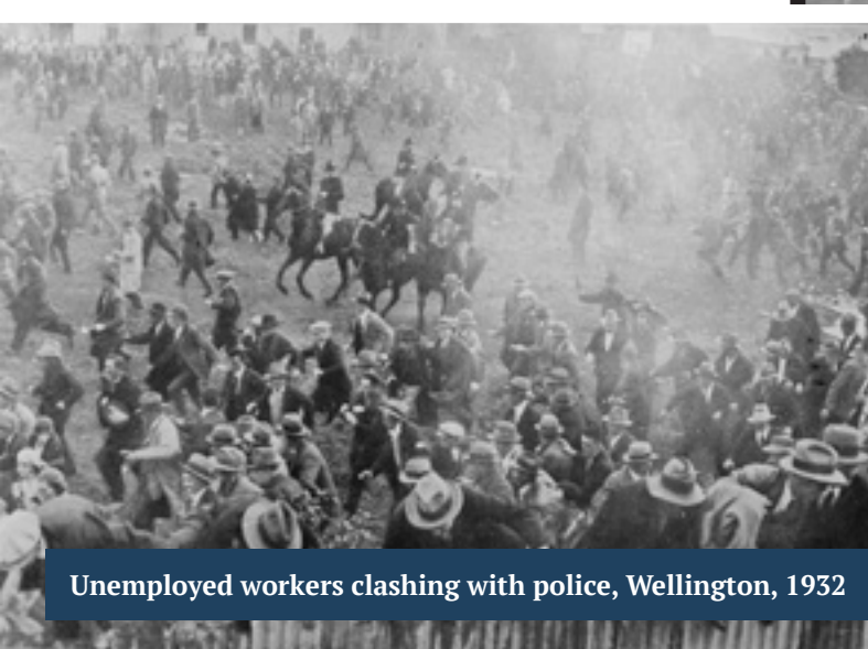
Unemployed workers clashing with police, Wellington, 1932