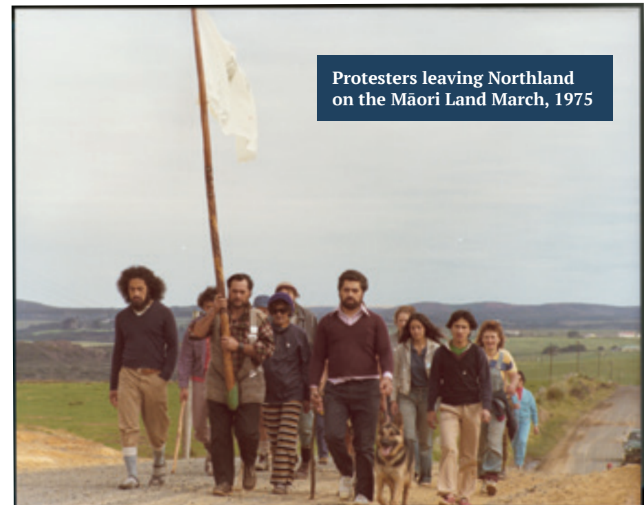
Protesters leaving Northland on the Māori Land March, 1975