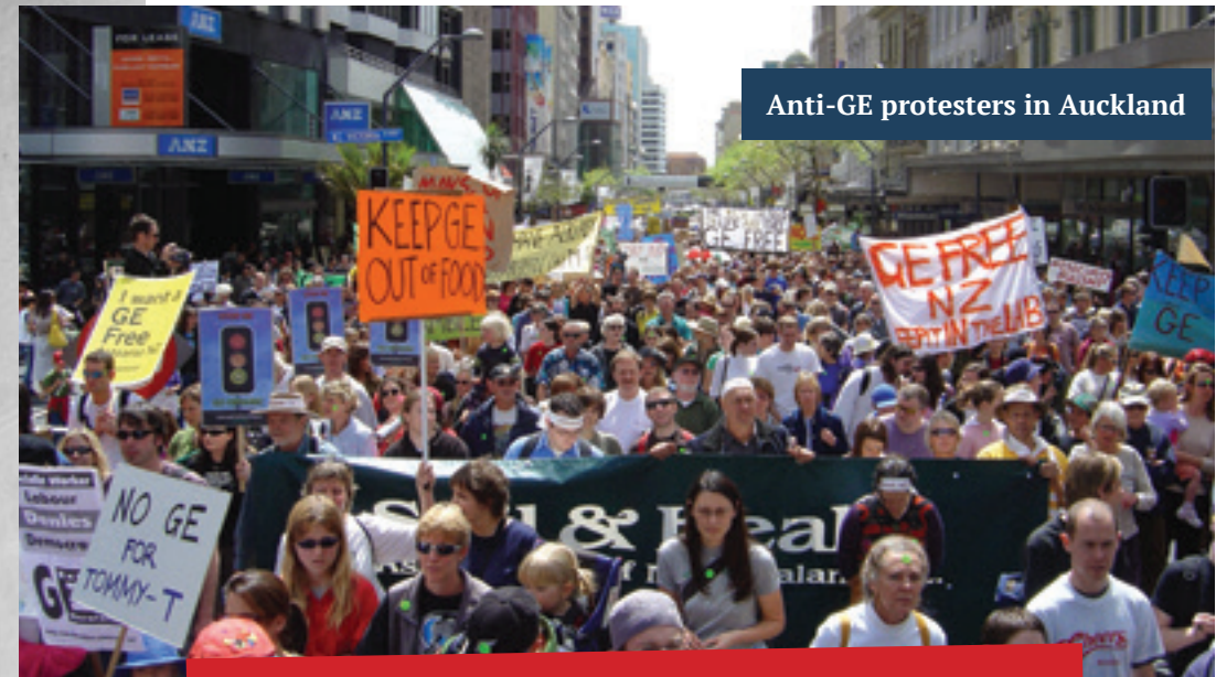
Anti-GE protesters in Auckland