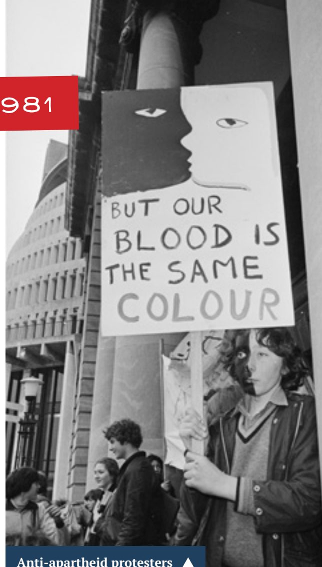
Anti-apartheid protesters in Wellington, 1981

One man in a South African prison heard about the protests. Later, he said he’d never forget the day the game in Hamilton was cancelled. “It was,” he said, “like the sun coming out.” That man was Nelson Mandela.