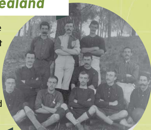
North Shore Football Club about 1895

When European settlers came to New Zealand, they brought the game of football with them. Auckland's North Shore club is the country's oldest football club. It started in 1886. The New Zealand Football Association (NZFA) began in 1891.