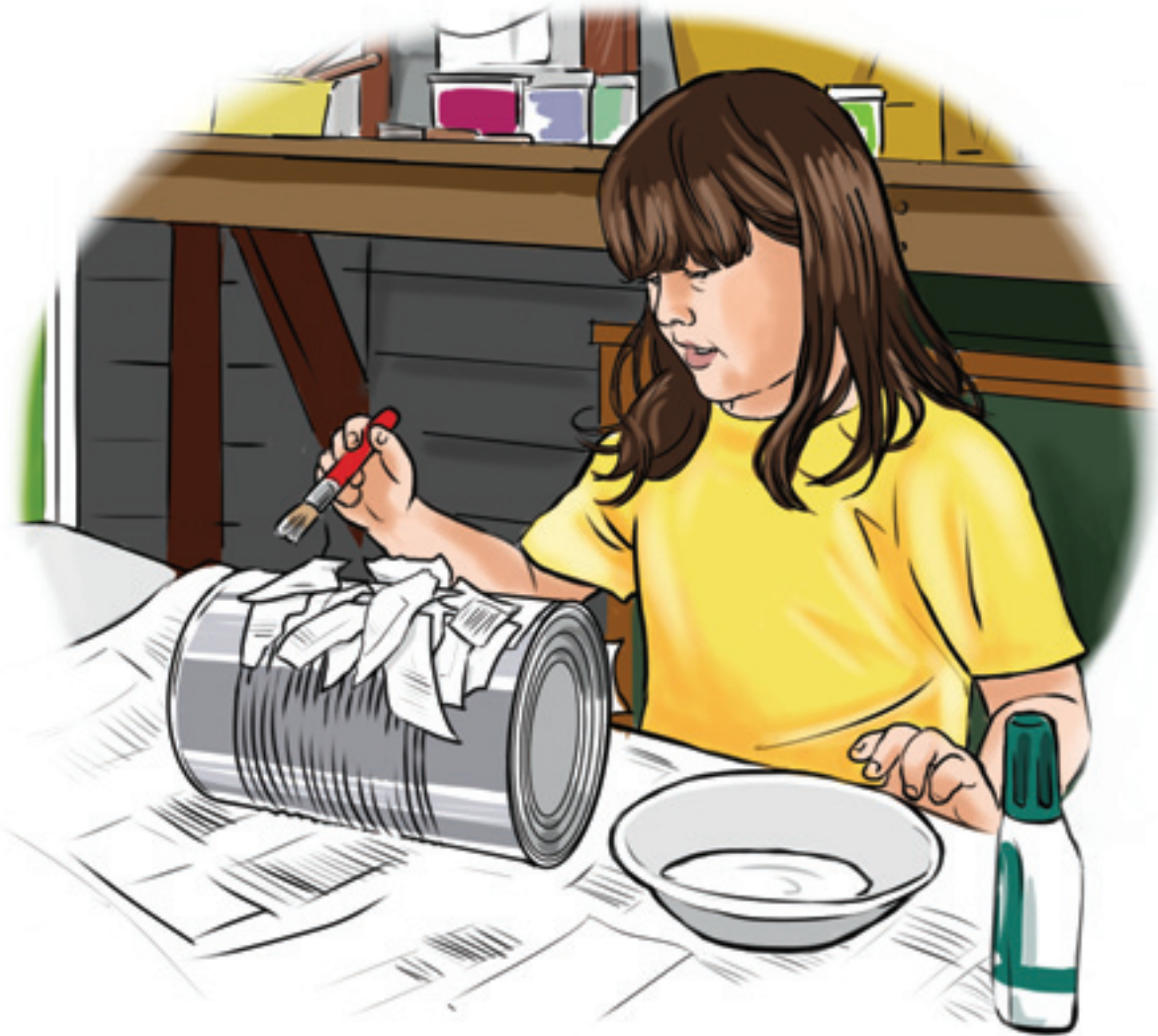
Malia glued the paper to the tin.