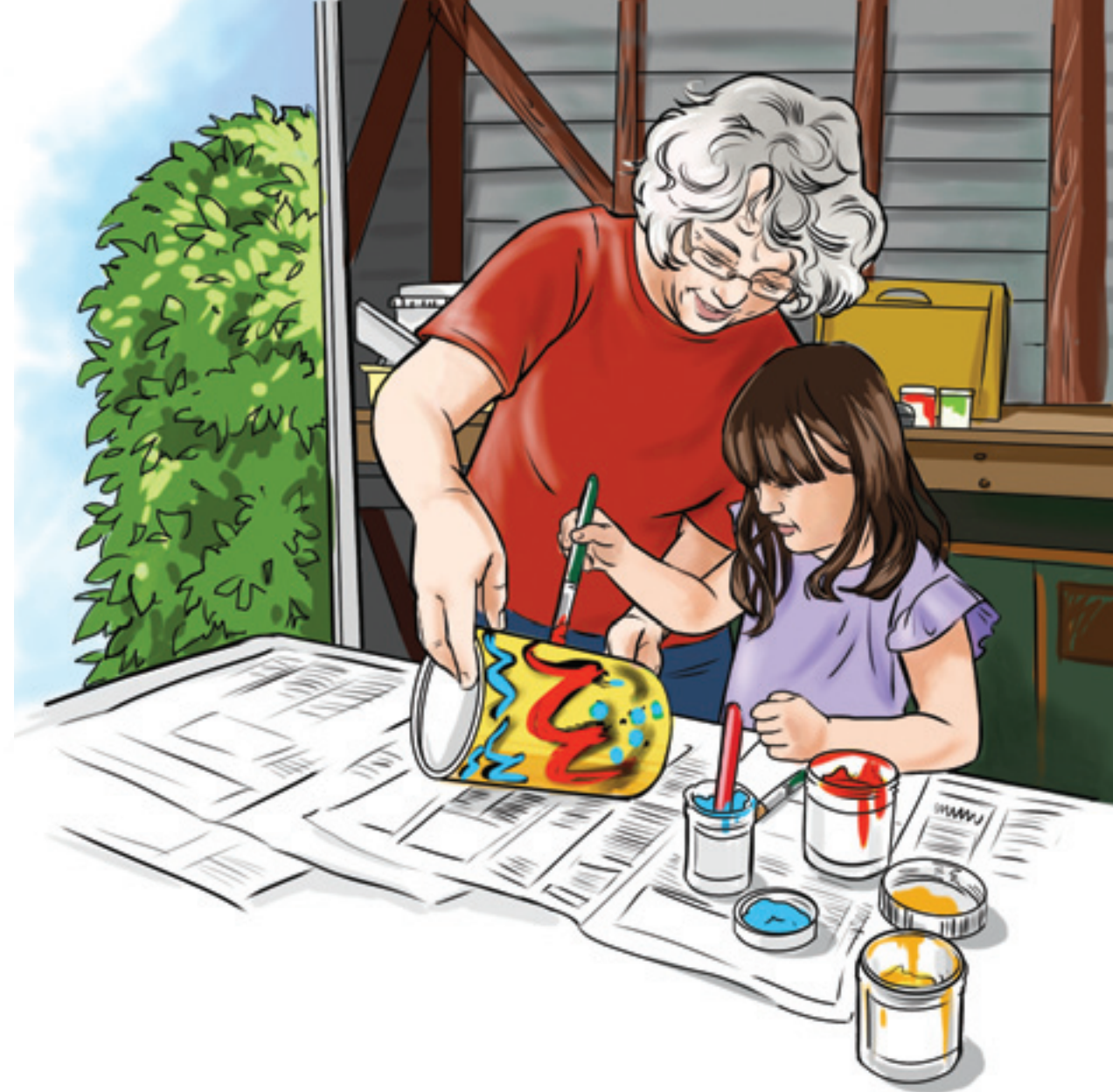
She painted the new vase.