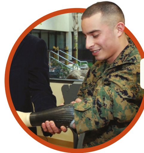
This man has a prosthetic arm.