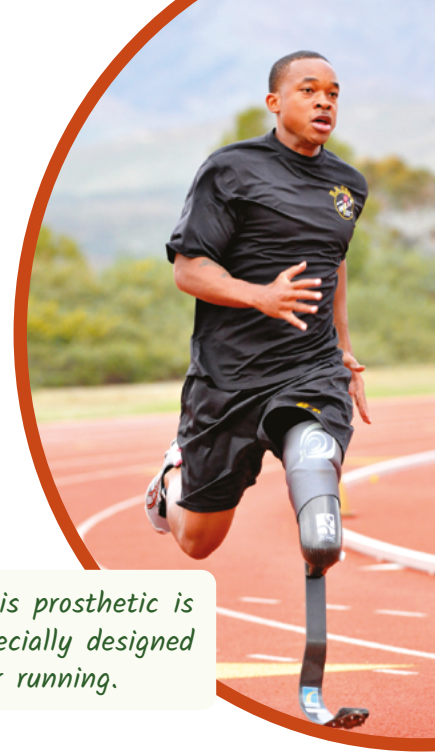
This prosthetic is specially designed for running.

Some prosthetics are powered by robotics. This makes the prosthetic move like a real body part.